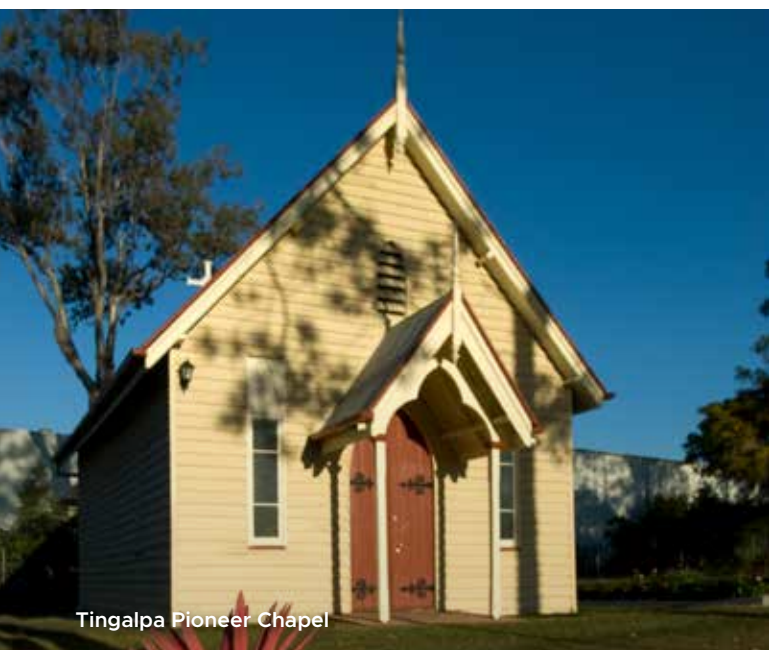
Tingalpa Pioneer Chapel

At the 30 June 2020 BLHN had 573 'Friends of BLHN' receiving regular e-Newsletters, an increase of 5.7% from last year. This e-Newsletter aims at informing members of the public about upcoming BLHN Member events and activities, including new exhibitions, seminars, talks, tours, performances as well as BLHN's own walking tours. The COVID-19 restrictions brought challenges to our regular format as member sites closed their doors and physical events were cancelled. We continued to supply updates to the public and channelled their interest in heritage towards virtual and online opportunities.