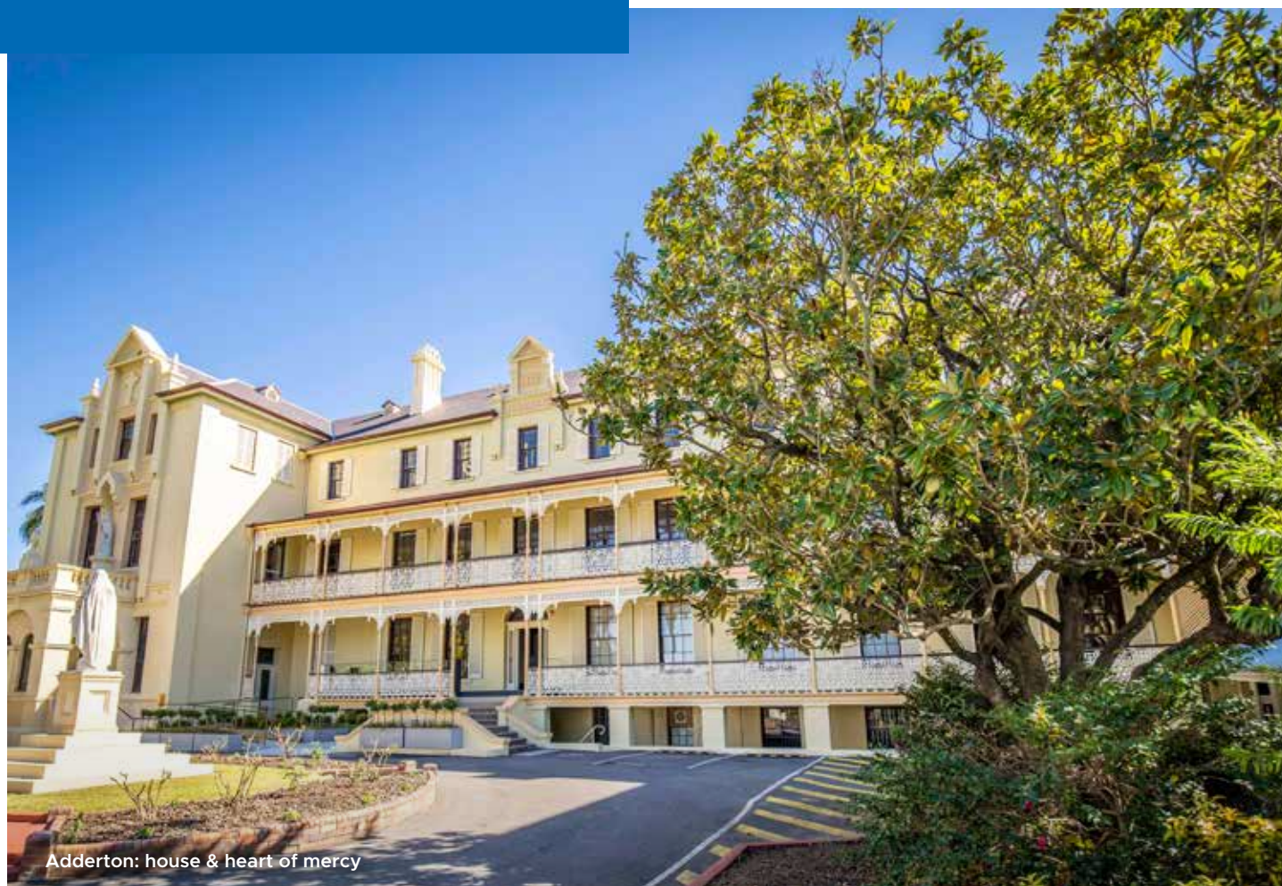
Adderton: house & heart of mercy