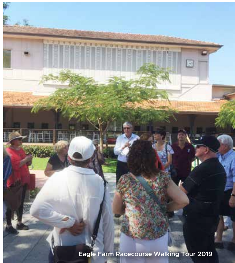
Eagle Farm Racecourse Walking Tour 2019

COVID-19 restrictions forced the cancellation of tours planned between April and June 2020 which had involved collaboration with other member organisations.