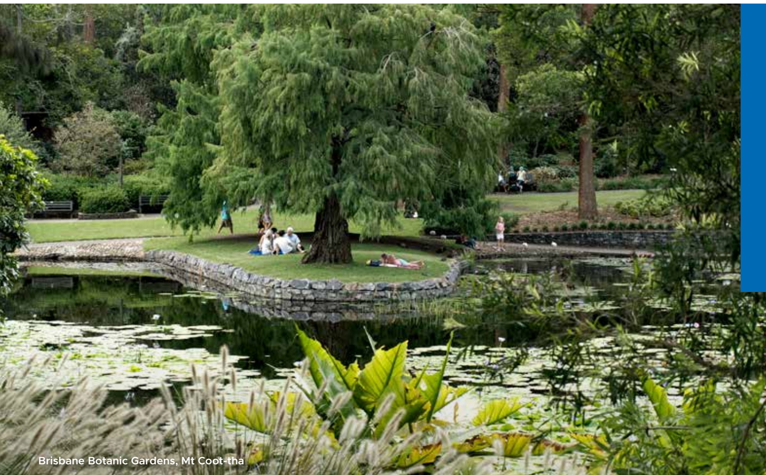
Brisbane Botanic Gardens, Mt Coot-tha

On behalf of my fellow Board of Directors I am proud to present the Brisbane's Living Heritage Network Annual Report 2019 – 2020.