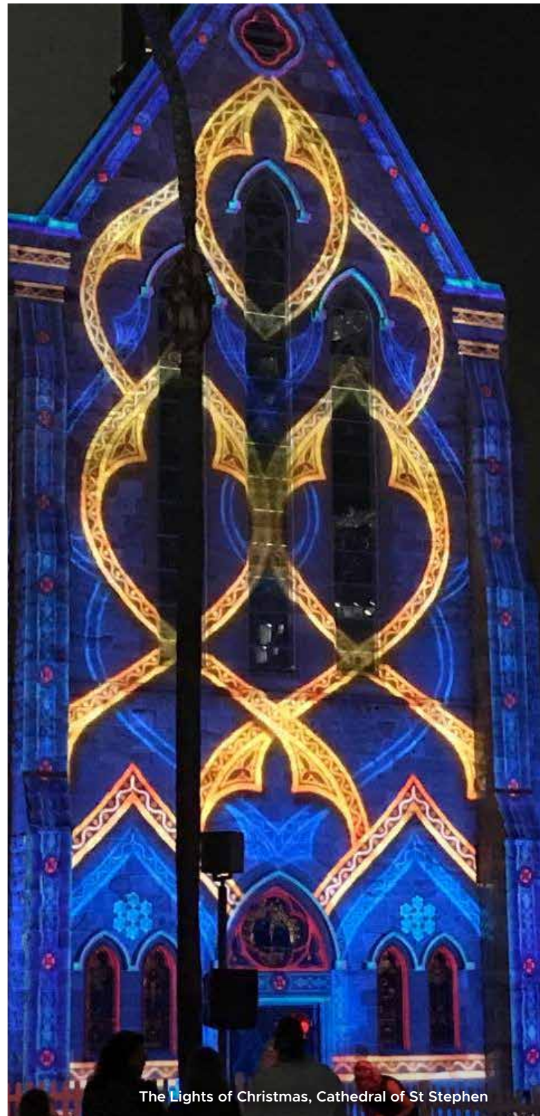
The Lights of Christmas, Cathedral of St Stephen