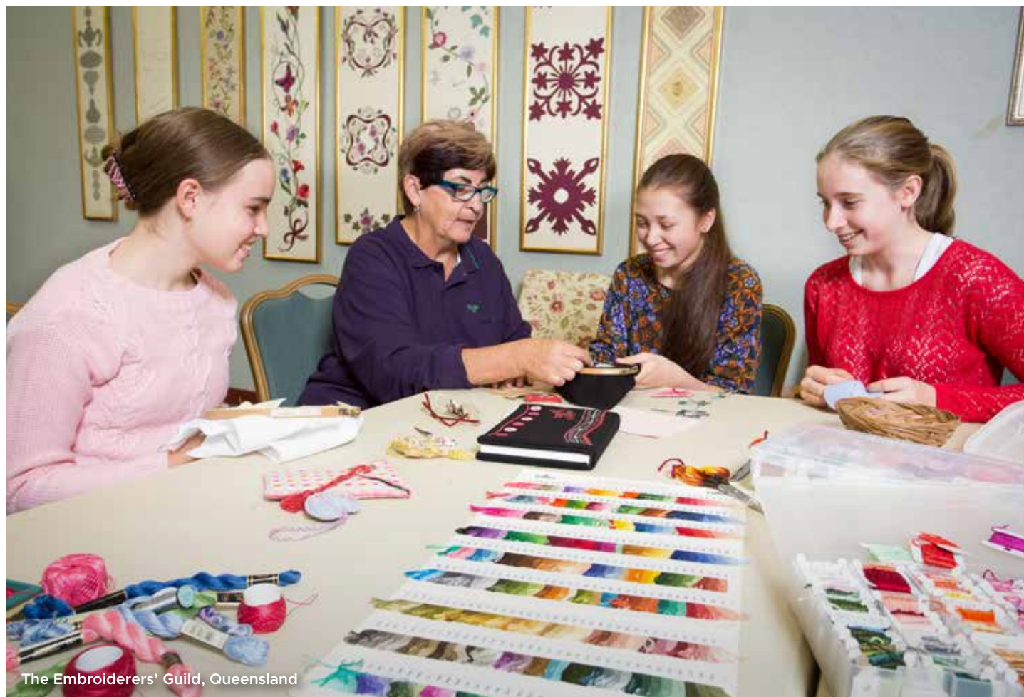
The Embroiderers' Guild, Queensland